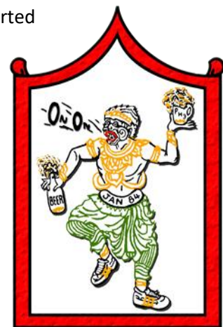
Hash House Harriers Pattaya, Thailand