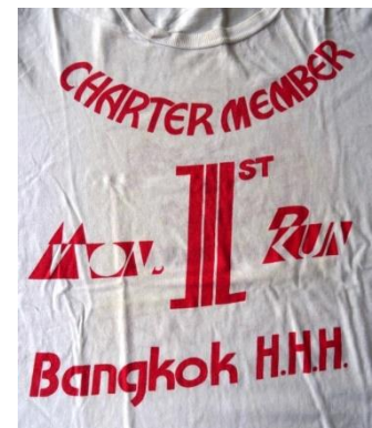
The first shirt for the Monday Hash